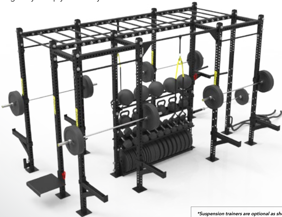
*Suspension trainers are optional as shown, and not included in price.

Build excitement in your facility when you develop functional training group classes using the 14' Premium Extension Rig. Your members will go crazy over the variety of movements! Support 10-12 people simultaneously with the dip station, squat rack, monkey bars, landmine, ball target, plyo step, optional Olympic bars and plates, battle rope, suspension trainers, and so much more. And our convenient, safe storage trays keep your facility clutter-free.