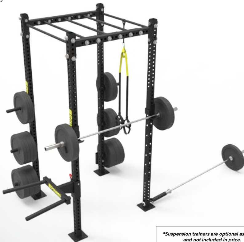
*Suspension trainers are optional as shown, and not included in price.

Designed for your facility's strength floor, our 4' Personal Monkey Bar Rig creates a variety of training opportunities. Members can enjoy individual training with monkey bars, dip station, squat rack, suspension trainer and landmine. Add Olympic bars and plates to attract your hardcore members. Convenient plate storage pegs keep the unit safe and clutter-free. Supports 4-5 people simultaneously.