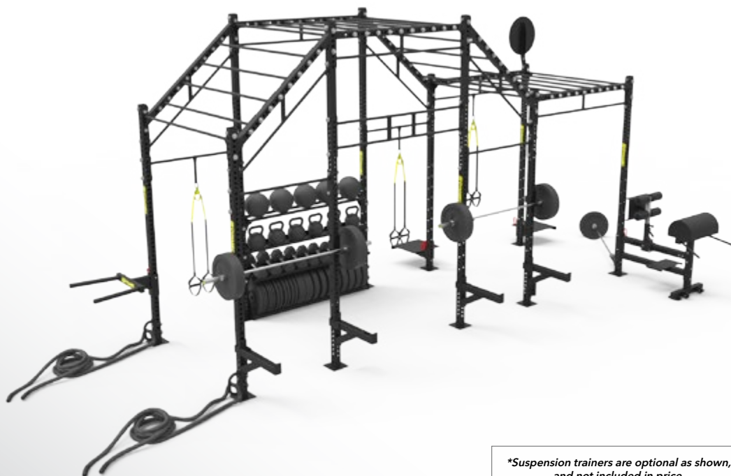
*Suspension trainers are optional as shown, and not included in price.

Train up to 18 people at the same time with the large 20' Monkey Bar Rig. Our limitless fitness, strength, and cross-functional stations keep your members coming back for more. Design your facility's space to fit your needs with the dip station, squat racks, monkey bar bridges, landmines, ball target, plyo steps, battle ropes, glute/ham developer, optional Olympic bars and plates, suspension trainers, and so much more! And the impressive storage area keeps your facility clean, safe, and clutter-free. Supports 16-18 people simultaneously.