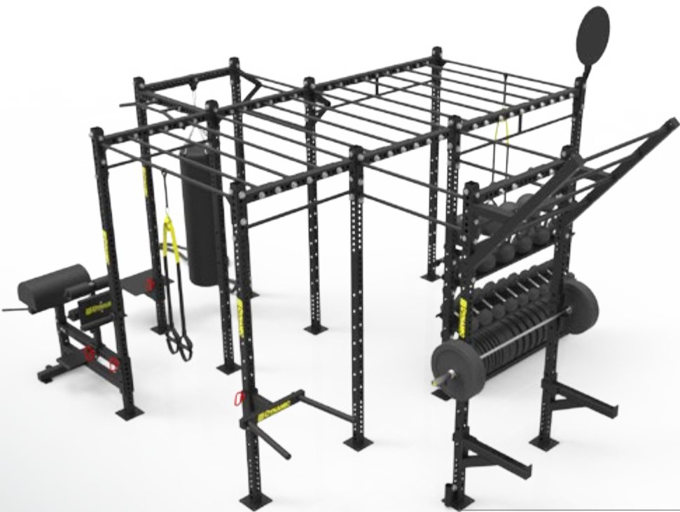
*Suspension trainers are optional as shown, and not included in price.

Build excitement in your facility when you develop functional training group classes using the 14' Premium "X" Rig. Your members will go crazy over the variety of movements possible! Support 12-14 people simultaneously with dip station, squat rack, monkey bars, landmine, plyo step, optional Olympic bars and plates, suspension trainers, battle rope, and so much more. And our convenient, safe storage trays keep your facility clutter-free.