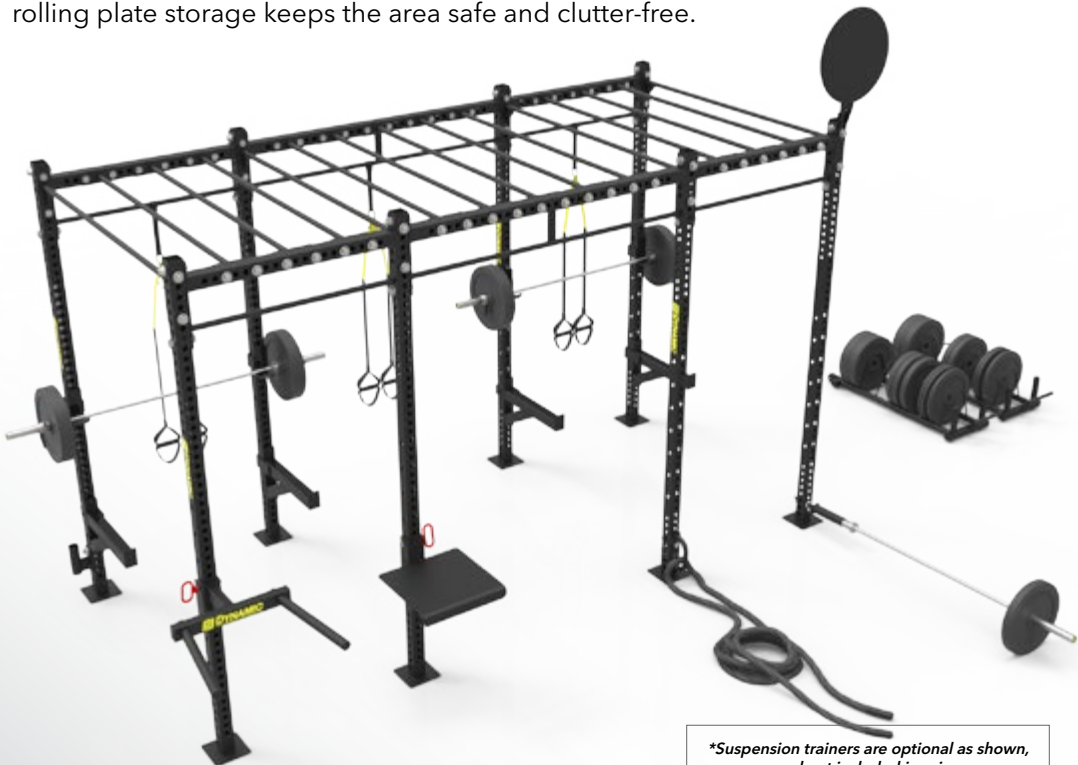
*Suspension trainers are optional as shown, and not included in price.

Build excitement in your facility when you develop functional training group classes using the 14' Monkey Bar Rig. Your members will go crazy over the variety of movements possible! Support 8-10 people simultaneously with dip station, squat rack, monkey bars, landmine, ball target, plyo step, battle rope, chin-up bar, pull-up bar, optional Olympic bars and plates, suspension trainers and so much more. Optional rolling plate storage keeps the area safe and clutter-free.