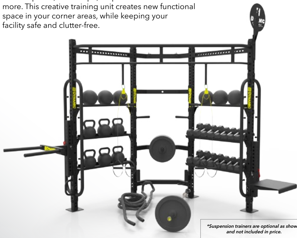
*Suspension trainers are optional as shown, and not included in price.

Build excitement in your facility when you develop functional training group classes using the Corner Training Unit. Your members will go crazy over the variety of movements possible, and you'll see new revenue come from a previously unused corner! Support 3-5 people simultaneously with the dip station, landmine, ball target, plyo step, chin-up bar, optional Olympic bar and plates, battle rope, suspension trainers and so much more. This creative training unit creates new functional space in your corner areas, while keeping your facility safe and clutter-free.