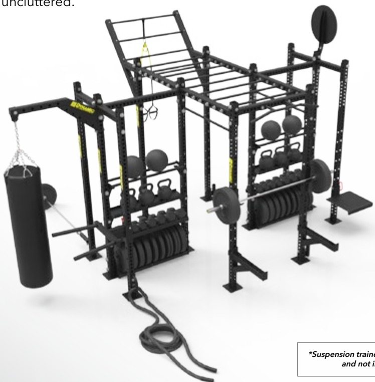
*Suspension trainers are optional as shown, and not included in price.

Build excitement in your facility when you develop functional training group classes using the 12' M 3 ZONE 4.0 Rig. Your members will go crazy over the variety of movements! Support 10-12 people simultaneously with the dip station, squat rack, monkey bars, landmine, ball target, plyo step, pull-up bar, flying pull-up extension, optional Olympic bars and plates, battle rope, suspension trainer and so much more. And our creative and safe storage feature keeps your facility uncluttered.