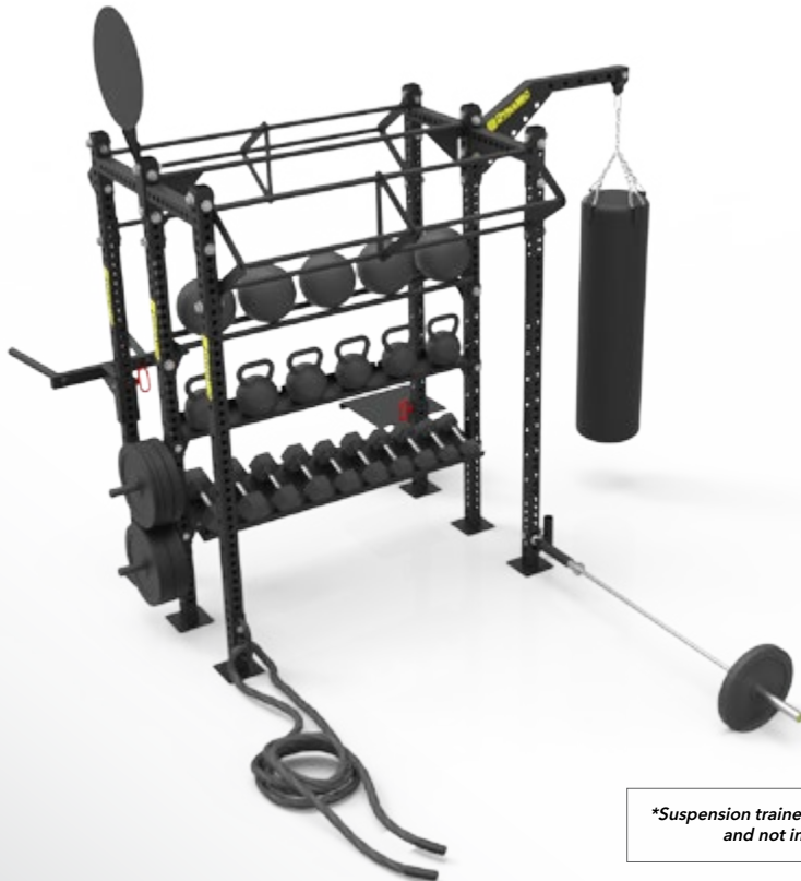
*Suspension trainers are optional as shown, and not included in price.

Designed for your facility's strength floor, our 6' M 3 ZONE 3.0 Rig comes with a variety of training stations. Members can enjoy individual training with the dip station, landmine, ball target and plyo step. Add the Olympic bar, plates, battle rope, suspension trainer and heavy bag to really attract your hardcore members. The simple, clean storage trays keep your facility clutter-free and looking its best. Supports 6-8 people simultaneously.