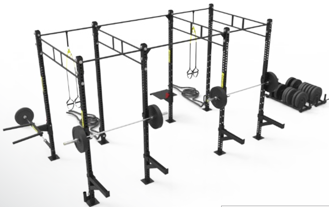
*Suspension trainers are optional as shown, and not included in price.

Build excitement in your facility when you develop functional training group classes using the 14' Standard Rig. Your members will go crazy over the variety of movements! Support 10-12 people simultaneously with the optional Olympic bars and plates, dip station, squat rack, landmine, plyo step, battle rope, and so much more. Optional rolling plate storage keeps the area safe and clutter-free.